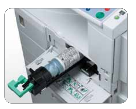
Full front accessibility for optimum ease of use and simple maintenance.

Enhance your company's image with splendid business documents. The Aficio<sup>™</sup>MP 1600<sub>⊥</sub>/ MP 2000<sub>∟</sub> deliver the precise quality you are looking for. As originals are scanned only once, stored into memory and reproduced from there, output is impeccable at all times. Crisp and clean, your documents are set to leave a first class impression.