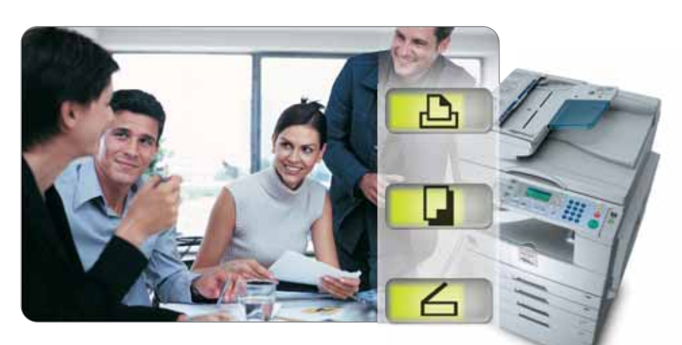
The Aficio<sup>™</sup>MP 1600L/MP 2000L print, copy and scan: a powerful combination in an ultra compact device, ready to be placed anywhere in your office.